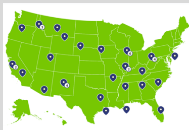
Map of jurisdictions using Public Safety Assessment. Available at advancingpretrial.org .