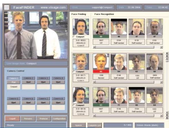
Display of recognition results in live mode