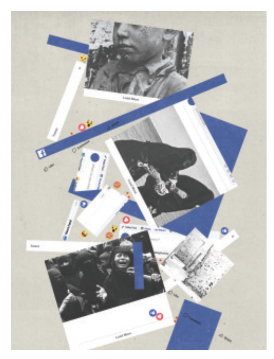
Illustration for Techonomy

This week a <u>New York Times investigation</u> revealed that Facebook had secret deals with numerous companies for access to user data, including in some cases the contents of millions of users' private messages. The companies included Amazon, Sony, Microsoft, Yahoo, Spotify, and Netflix, as well as two firms considered security threats to the U.S.: Chinese smartphone manufacturer Huawei and Russian search engine Yandex.